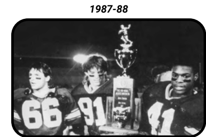
Football | Div. IV Champion