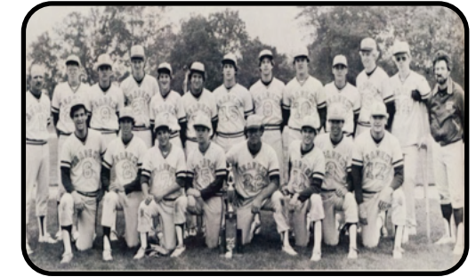
1982 Baseball Class A Champion