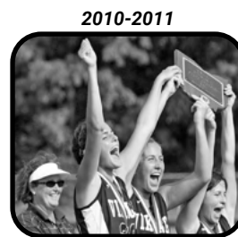
Girls Lacrosse | Div. II Champion

2011-12 Boys Track & Field | Div. III Champion