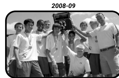
Girls Tennis | Div. I Champion Field Hockey | Div. I Runner-Up Boys Tennis | Div. II Champion

2009-10 Field Hockey | Div. I Runner-Up Boys Tennis | Div. II Champion