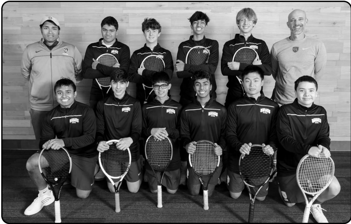
JV Boys Tennis Roster