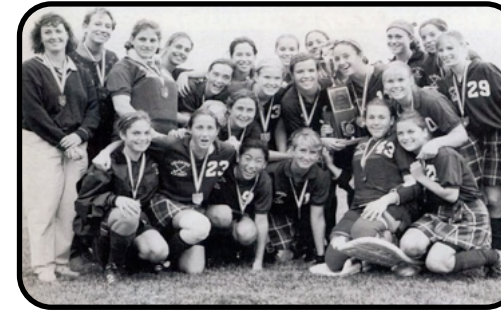
1994 Field Hockey Div. I Champion

2003-04 Football | Div. V Champion Field Hockey | Div. I Champion Boys Golf | Div. III Runner-Up