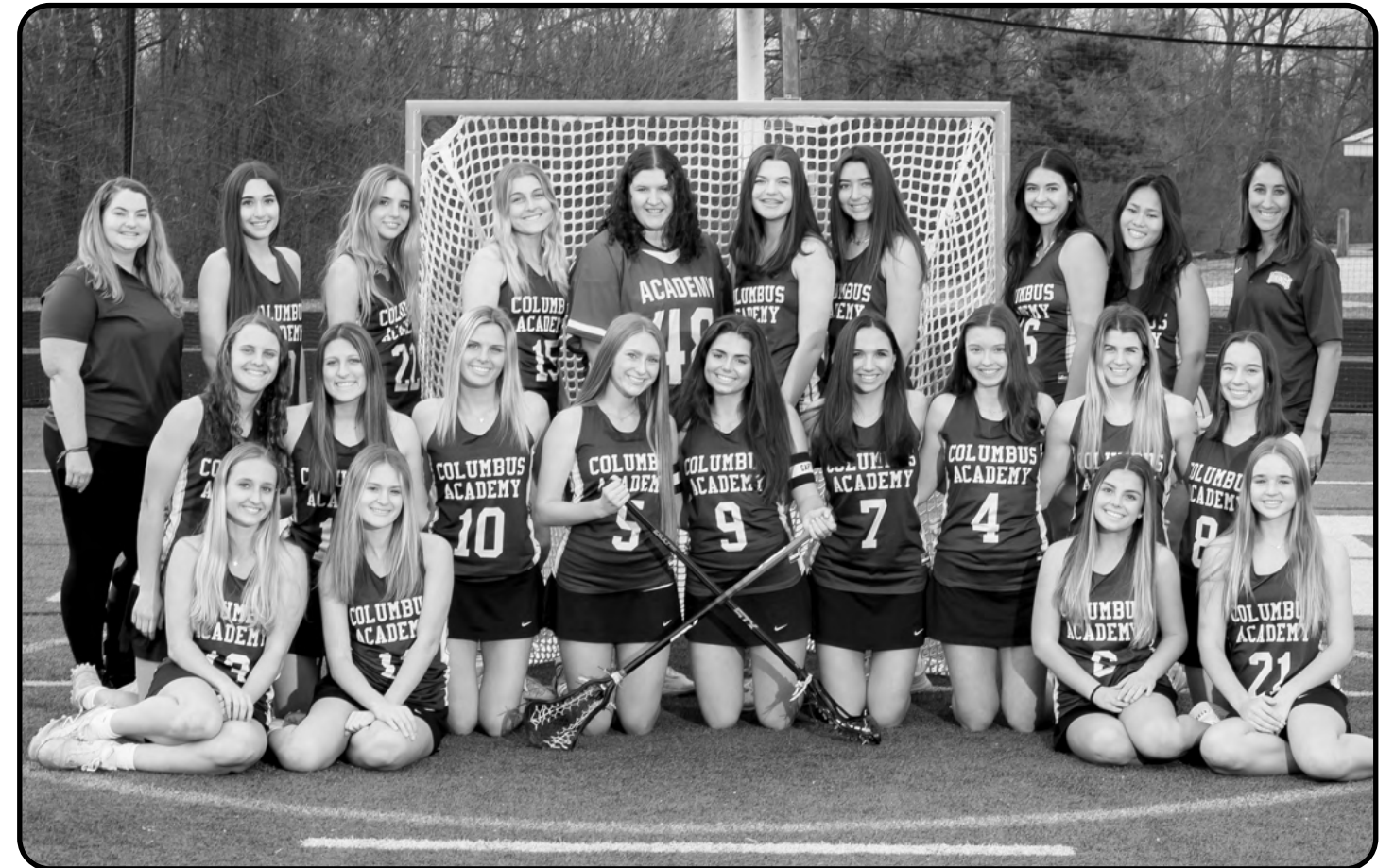
Varsity Girls Lacrosse Roster