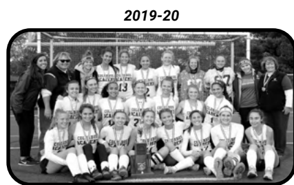
Boys Golf | Div. II Champion Field Hockey | Div. I Champion

2020-21 Boys Golf | Div. II Champion Girls Tennis | Div. II Runner-Up