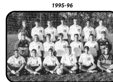
Boys Soccer | Div. II Champion Boys Golf | Div. III Champion Boys Track & Field | Div. III Runner-Up

1996-97 Field Hockey | Div. I Runner-Up Girls Tennis | Div. II Runner-Up Boys Tennis | Div. III Runner-Up