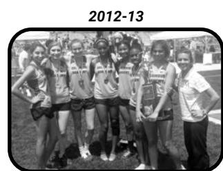
Field Hockey | Div. I Champion Girls Tennis | Div. II Runner-Up Boys Tennis | Div. II Runner-Up Boys Track & Field | Div. III Champion Girls Track & Field | Div. III Runner-Up

2013-14 Boys Golf | Div. III Runner-Up Field Hockey | Div. I Champion Boys Tennis | Div. II Runner-Up