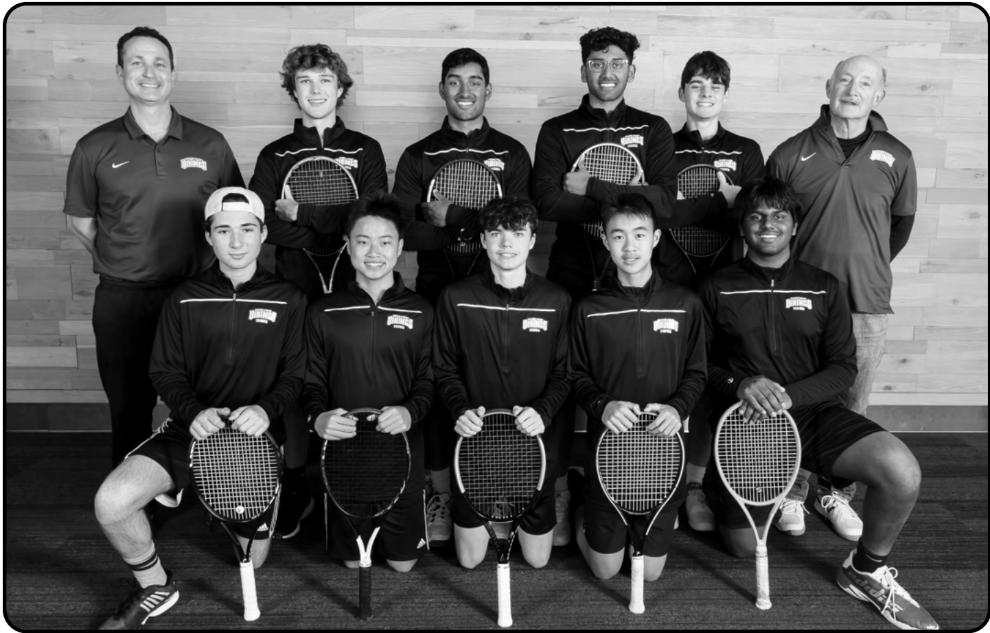
Varsity Boys Tennis Roster