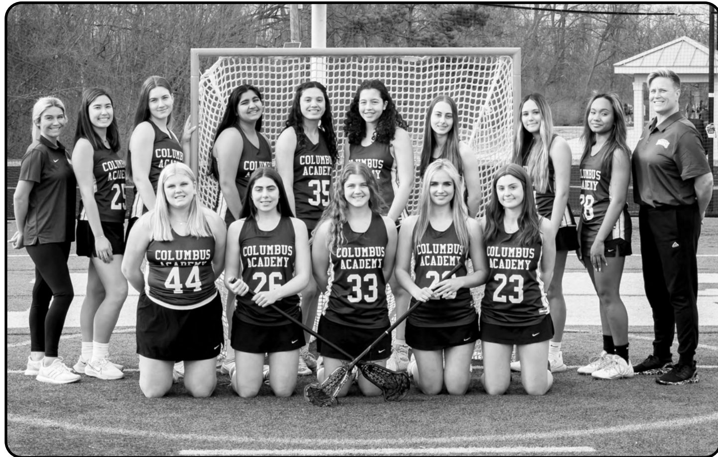
JV Girls Lacrosse Roster