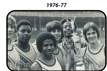
Boys Track & Field | Class A Champion

1979-80 Boys Track & Field | Class A Runner-Up