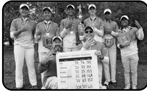
2021 Boys Golf Div. II Champion