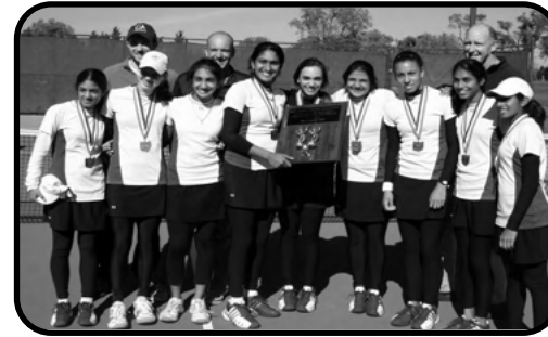
2008 Girls Tennis Div. I Champion

2011-12 Boys Track & Field | Div. III Champion