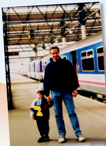
Getting on the train at Waterloo station in 1998.