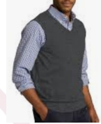
V-neck Sweater Vest